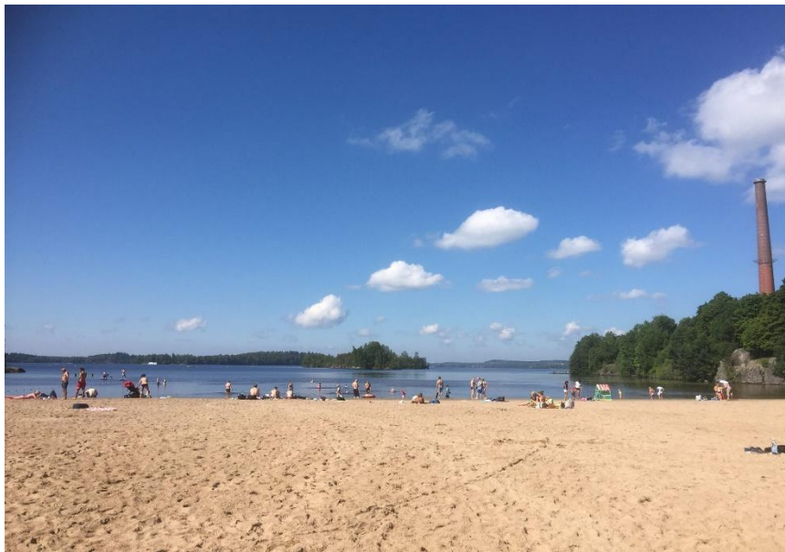
Figure 1 Pyynikki beach https://www.facebook.com/Pyynikinranta/

Coastal rowing beach sprint will be organized on Pyynikki beach. Lake Pyhäjärvi is located south of Tampere and it is the second largest lake in the area.